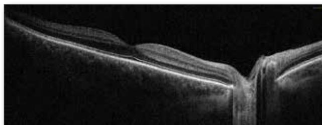
Fig. 1. OCT image of a healthy fovea and optic disc (right eye).

normal discs, with a cup-to-disc ratio of 0.2 OU. OCT was normal OU (Fig. 1, 2).